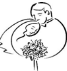
Marriage on the Rock

We are having a fellowship once a month for a time of connecting with couples who are interested in being a part of this ministry or are involved in marriage ministry. We had a great time in October and look forward to December 10 , which will be our next get together. We are looking into doing a Bible study dealing with marriage. So, if you would like to join us, please call 501-1933 or 473-0945 if you need more information and direction to our home.